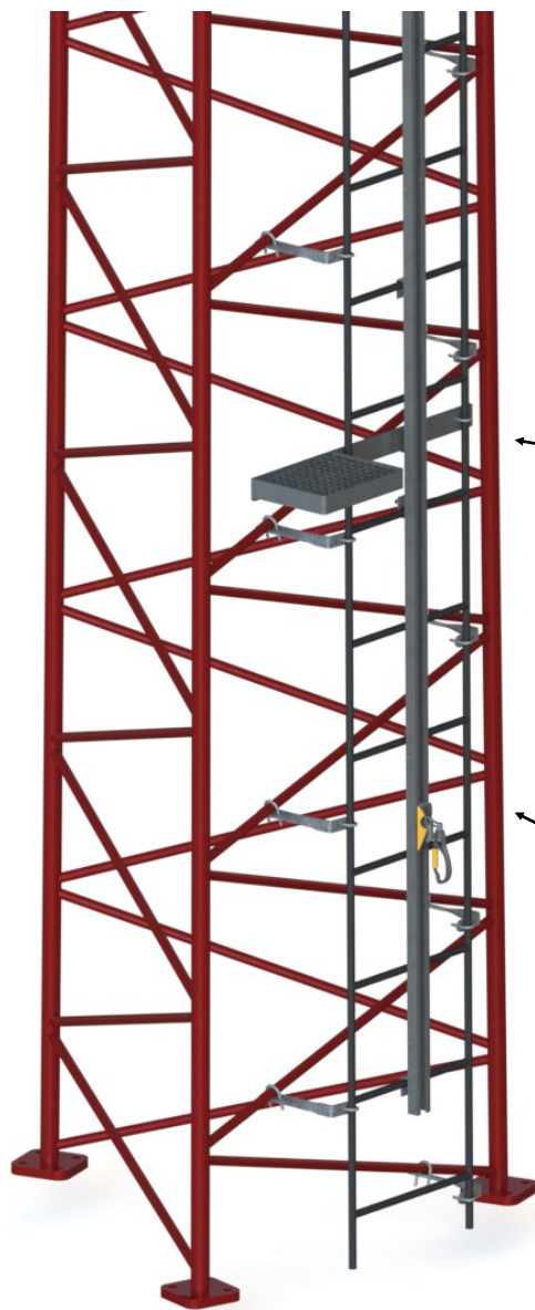
Carl C. resting platform mounted on ladder